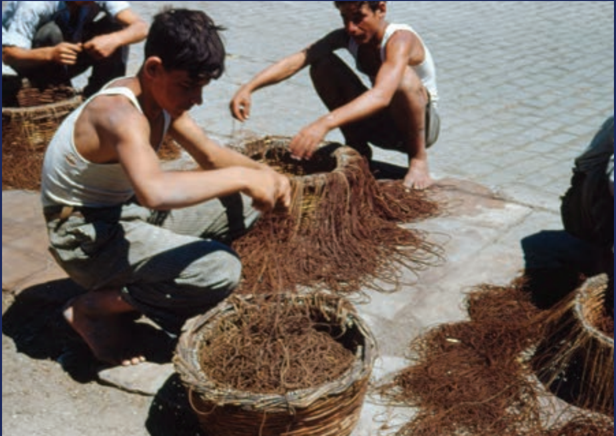
Young men inspect their nets, Greece, c. 1950. During World War II, fishermen suffered as their boats and equipment were destroyed in Nazi air raids. During the occupation, NEF case workers helped procure nets and lease boats for Piraeus fishermen so they could continue their work.