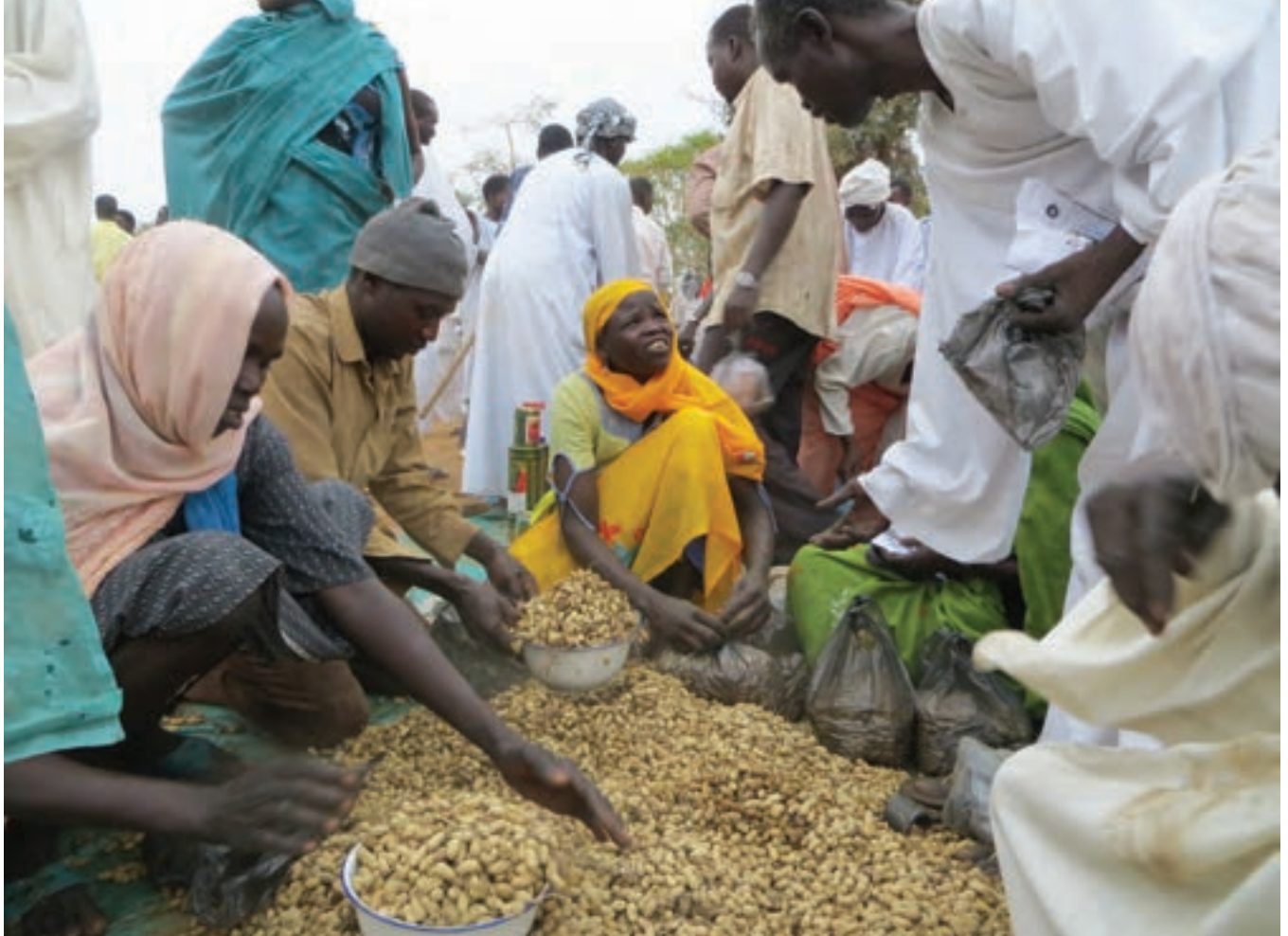
Seed fairs like this one in Central Darfur enable farmers to access high quality seeds and tools while jumpstarting local markets post-conflict, 2012.

laboration. NEF is harnessing the market to promote “win-win” relationships to create incentives for ongoing cooperation and reconciliation.