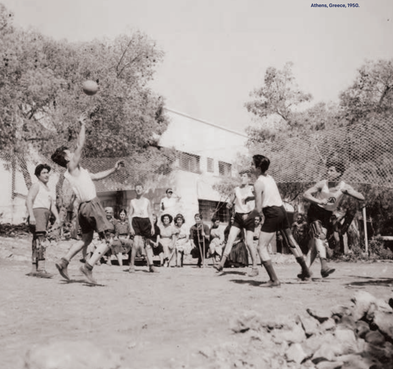
Young men who lost limbs to the war or remnant landmines play volleyball at NEF's rehabilitation center. Athens, Greece, 1950.