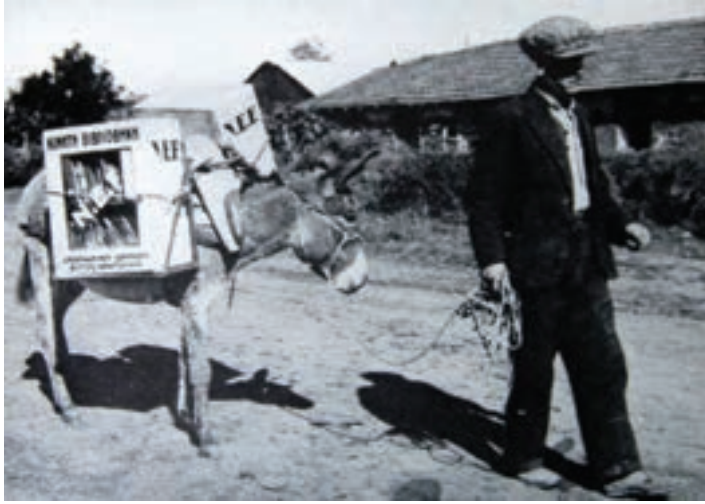
A mobile library regularly delivered books to Macedonian villages. 1930s.

refugee named Theodore Pays at its head. Pays had worked for Near East Relief in Constantinople and, in 1922, accompanied orphan children evacuated from that city to Greece. Soon Pays organized reading rooms, community centers, and village and mobile libraries.