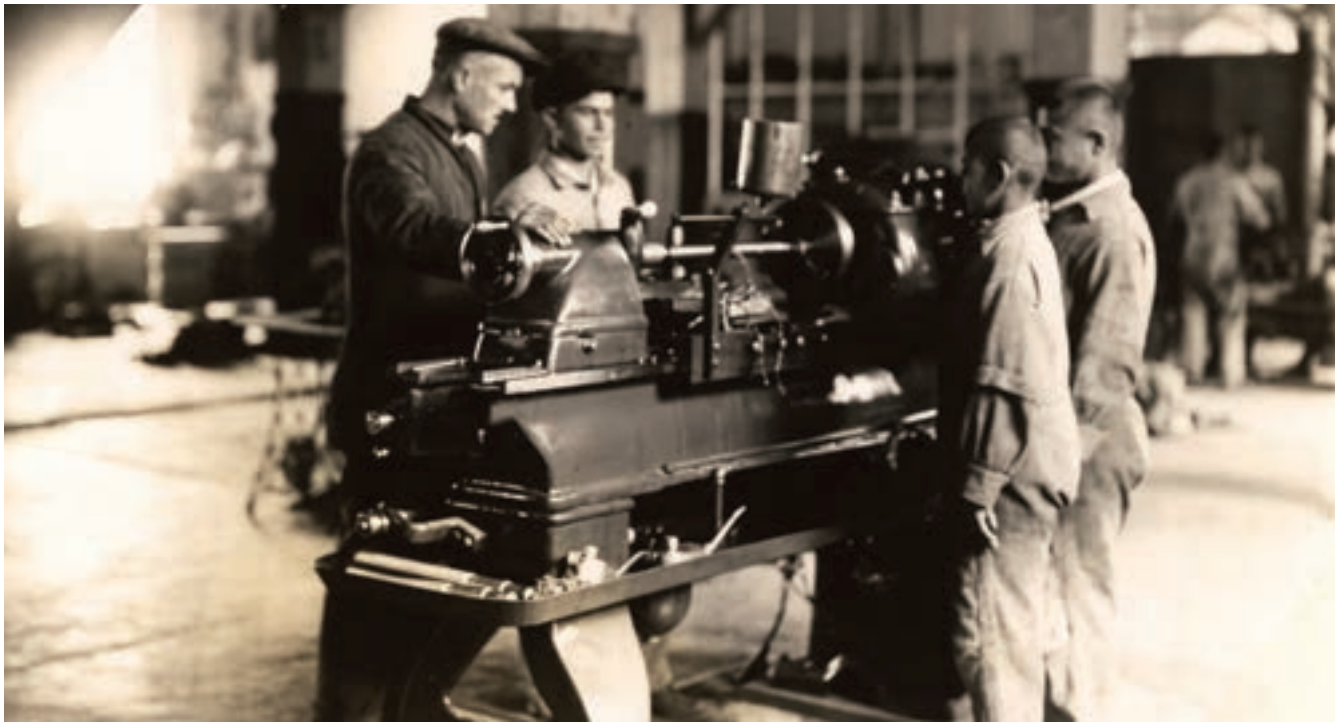
Clockwise from top left: Children in front of the Bird's Nest Orphanage in Sidon, Syria, 1924. Bird's Nest children play with tricycles made by the boys training as carpenters at the nearby Maameltein Orphanage, 1924. Boys train in a NER machine shop in the Caucasus, c. 1920. Girls sew garments in an outdoor workshop at Kazachi Post Orphanage, Alexandropol, c. 1920.