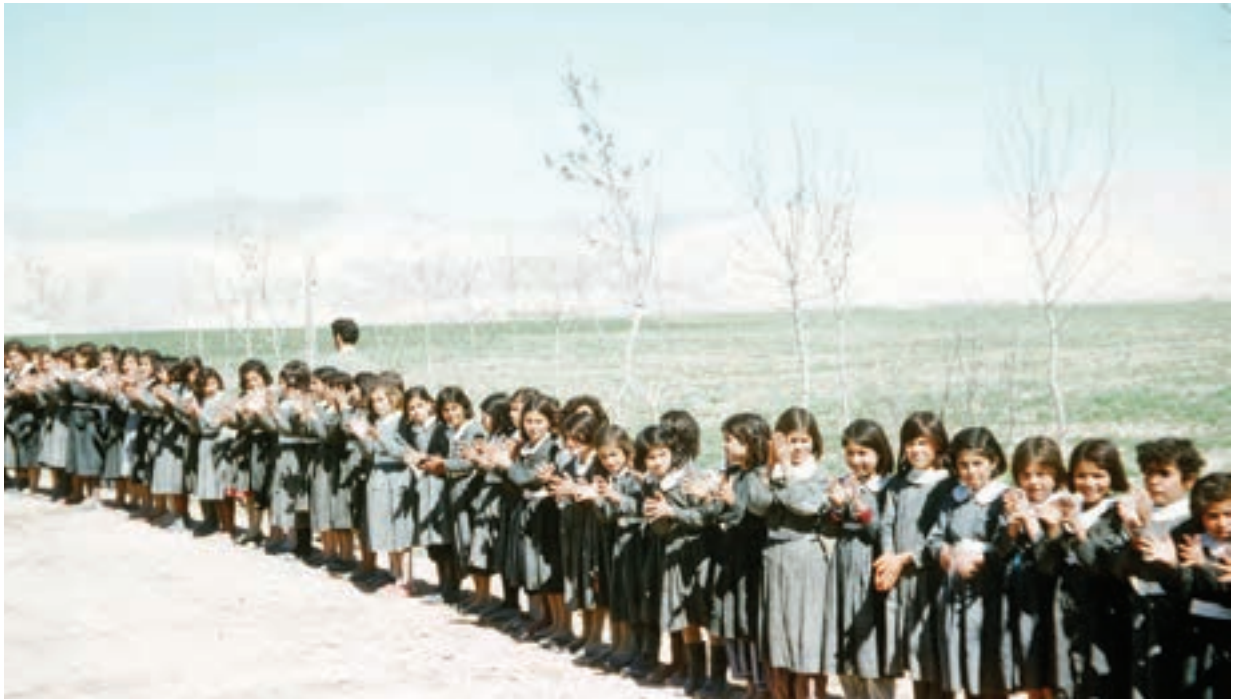
NEF helped advance rural primary school education in Iran, particularly for girls. Here, girls in uniform stand outside of their school, c. 1950s.

Rural Education. In 1947, there were only three schools in the Veramin area. By 1956, there were 86 schools in operation with over 6,200 students enrolled—about a quarter of whom were girls. NEF developed a curriculum for village schools that was subsequently adopted by the Ministry of Education for nationwide use.