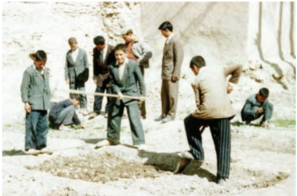
Boys at a rural school and at work in their school garden, 1957. NEF helped advance primary education for rural communities by developing teacher training programs and a curriculum that offered a supply of qualified teachers and practical information.

Foundation began the program in the Veramin Area. The program was designed to facilitate smallholder farmers' access to capital so that they could improve their agricultural practices without exposure to exploitative lending practices.