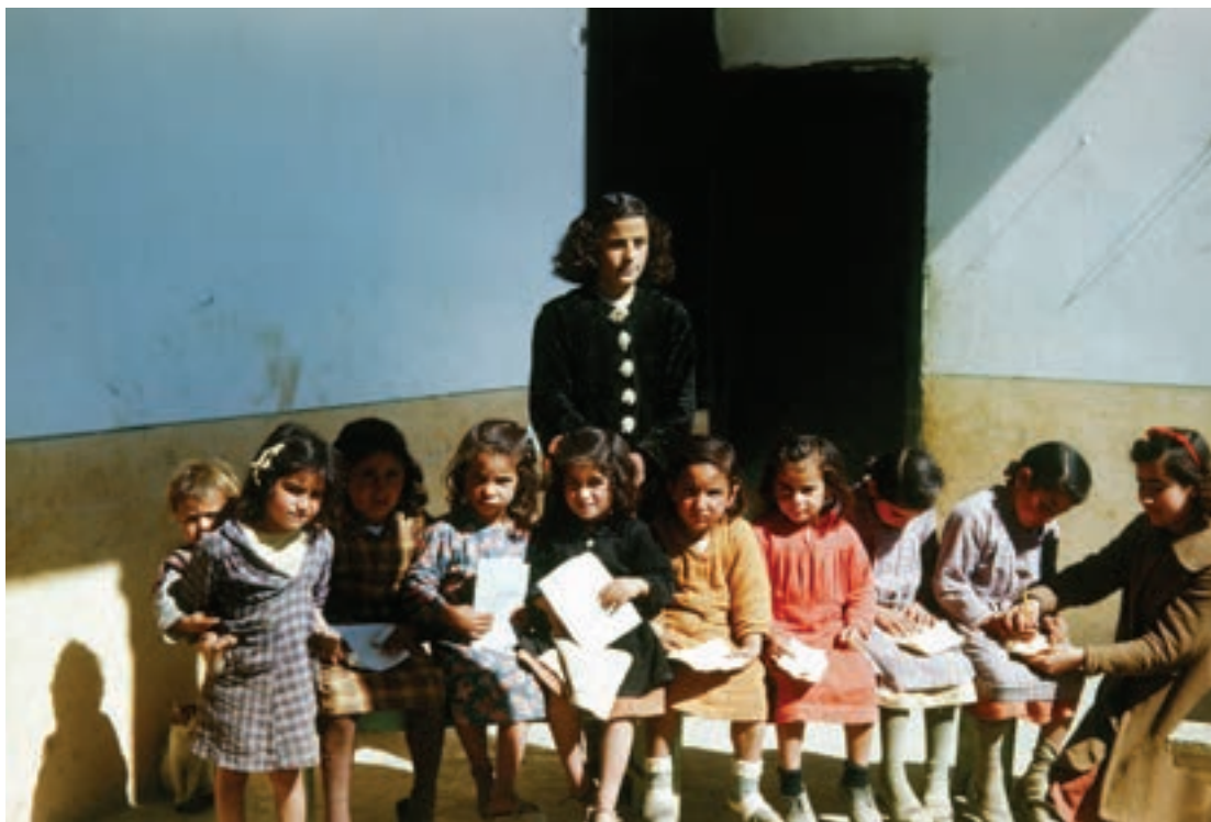
Above: Young girls and their teacher in Bar Elias, Lebanon, 1947. Opposite: A Palestinian refugee Camp in Jordan, c. 1950.