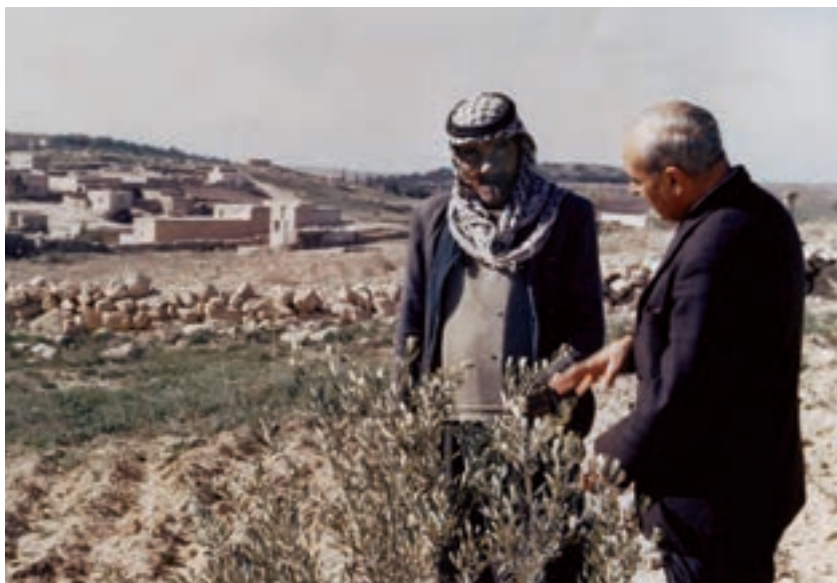
Men inspect a newly planted olive tree in Jordan, c. 1972. The NEF Rural Resources Development Program distributed over 150,000 olive tree seedlings to farmers in south Jordan in 1972.

properly by employers and that they were doing a satisfactory job.