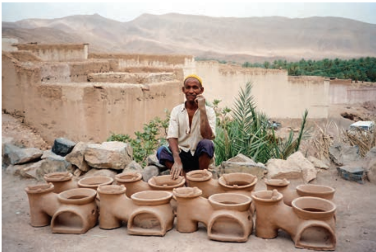
A potter in southern Morocco displays the fuel-efficient cookstoves he learned to make at NEF's Appropriate Technology Training Center, 1996.