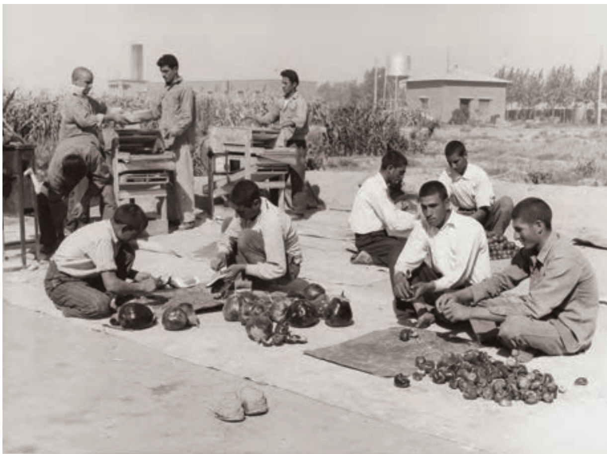
Young men at the Mamazon Training Center collect seeds, c. 1957. NEF's first teacher training school began in a remodeled donkey stable in Palasht; later a permanent center was developed in the village of Mamazon.

Agricultural Rehabilitation, Land Tenure & Rural Development. NEF operated a demonstration farm to introduce improved agricultural techniques and to encourage adoption of modern cultivation practices. It introduced improved techniques for livestock, poultry, citrus, vegetable production, and other crops. Beyond agriculture, NEF developed short courses for construction workers to improve building practices and for village youth on the operation of machinery. It helped the Ministry of Interior Community Development Department implement a nationwide rural improvement program.