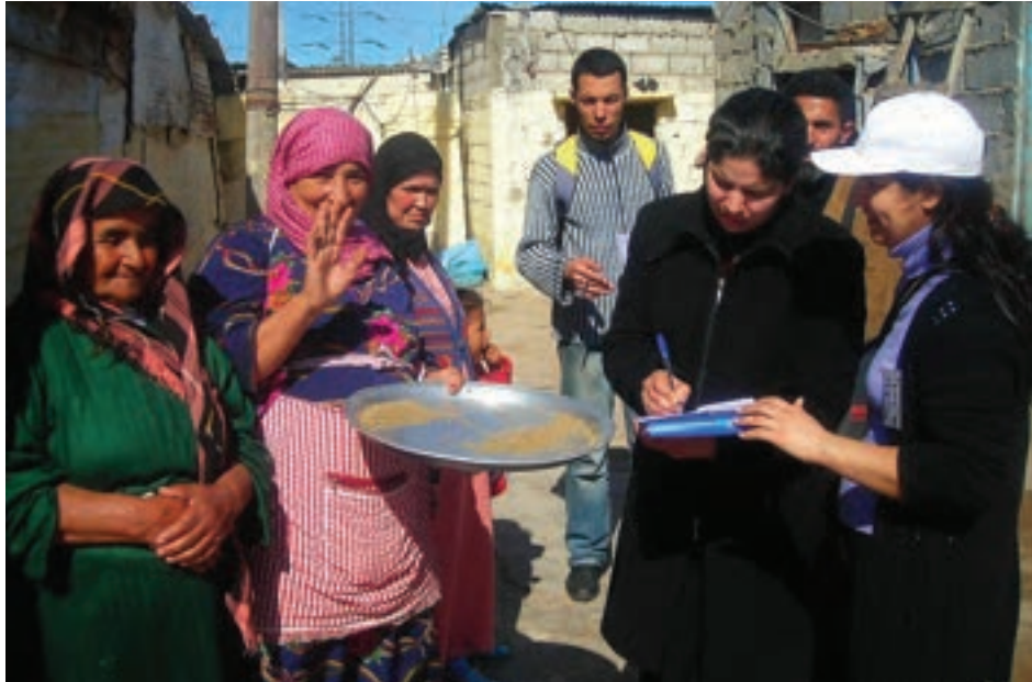
NEF staff members conduct a census in the peri-urban shantytown of Nouacer in Casablanca, c. 2006.

touched the lives of 16,000 students in 114 schools—half of them girls—between 2005 and 2010. The regional academies for southern and central Morocco adopted NEF’s approach. NEF continues to work to replicate and expand the PTA model based on community demand and works on social accountability more broadly, using rural education as a platform to organize communities.