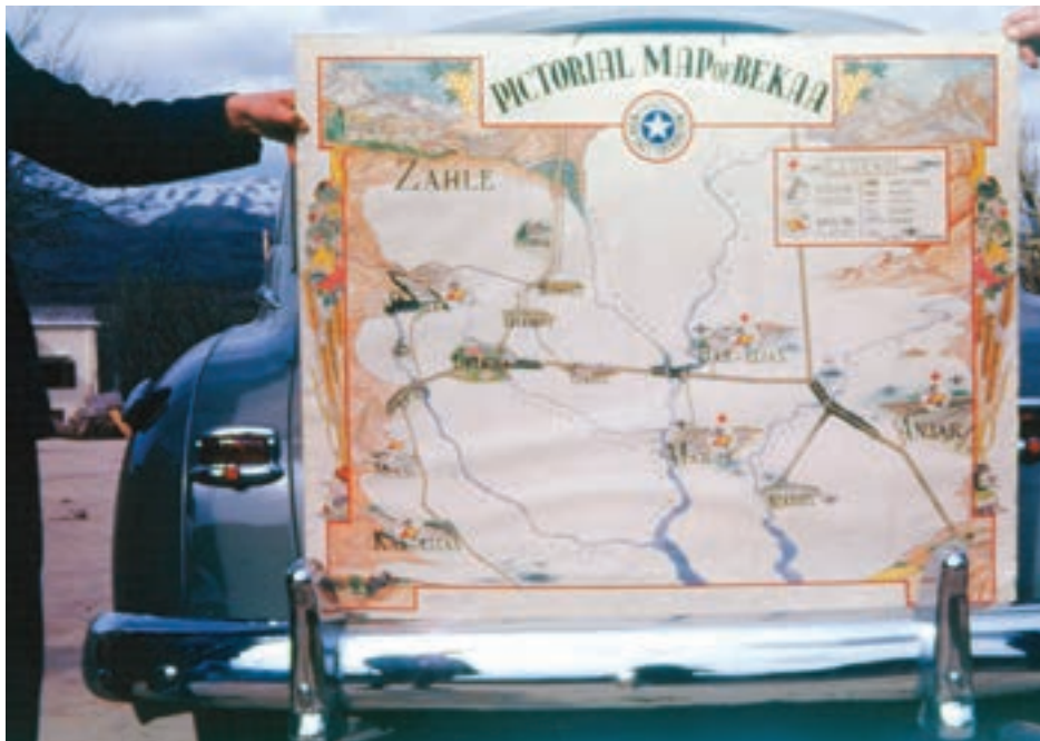
A map showing NEF's activities in the Bekaa Valley, Lebanon, c. 1952.