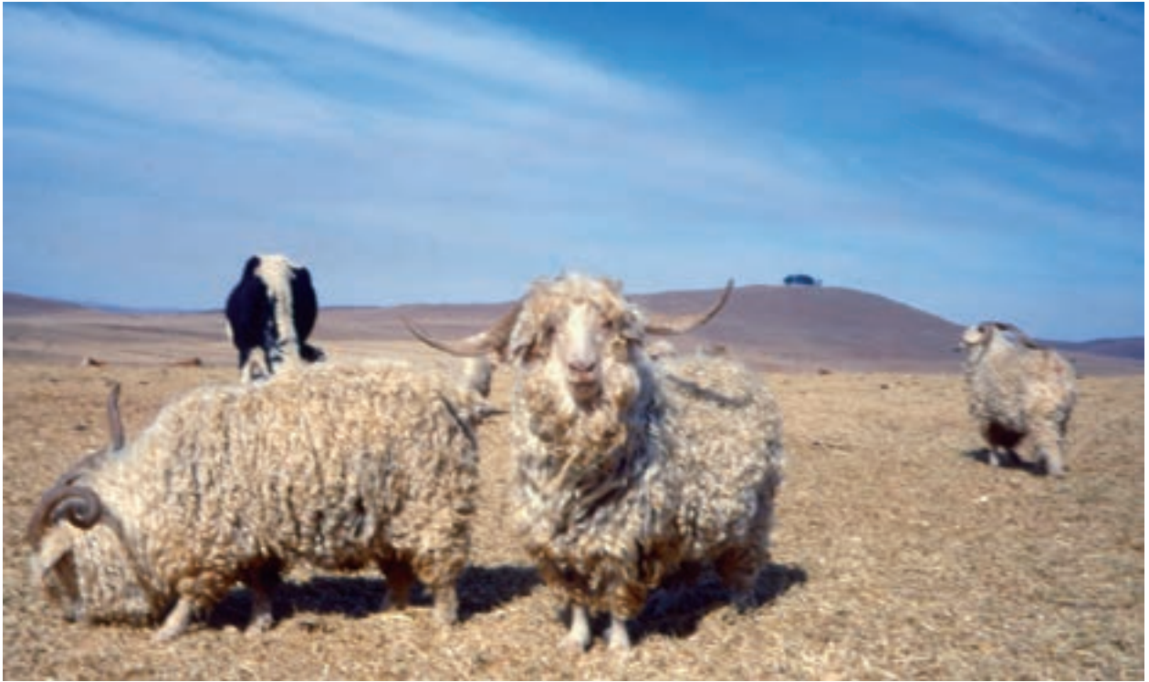
Above: Angora goats in Swaziland, 1980. NEF worked with the government and farmers to establish a domestic herd of Angora breeding stock and encourage mohair production. Below: Graduates of a course at the Cameroonian Department of Agriculture's Muyuka Poultry Center, a joint government-NEF-USAID project. Cameroon, 1966. To increase income and access to food, the program introduced improved breeds, constructed poultry-raising facilities, established vaccination programs, and developed extension activities to train local farmers in improved practices.