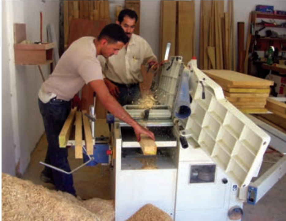
In Jordan, NEF used participatory development techniques to help Ajloun carpenters establish this cooperative workshop, c. 2005.

Jordan: Participatory Rapid Appraisal. In the early 1990s, NEF introduced Participatory Rapid Appraisal (PRA) as a new tool for assessing community needs and challenges and for designing programs to address community needs in a participatory manner. Building on methods developed in India, NEF adapted PRA for use in the Middle East, built a library of translated and original documents and training materials, and introduced PRA methods to development programs in Jordan and Egypt. NEF also offered training workshops in PRA for participants from Iran, Syria, Sudan, Egypt, and Lebanon.