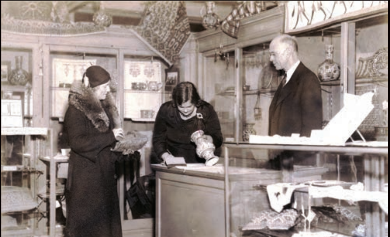
Clockwise from top left: A handmade "lace luncheon set" advertised in a Near East Industries catalog. The pieces ranged in size from five inches (selling for thirty-five cents) to twenty-two inches in diameter ($9.50). Refugee women in Salonika, Greece weave rugs from unraveled sweaters, 1925. The Near East Industries shop in New York City, c. 1926