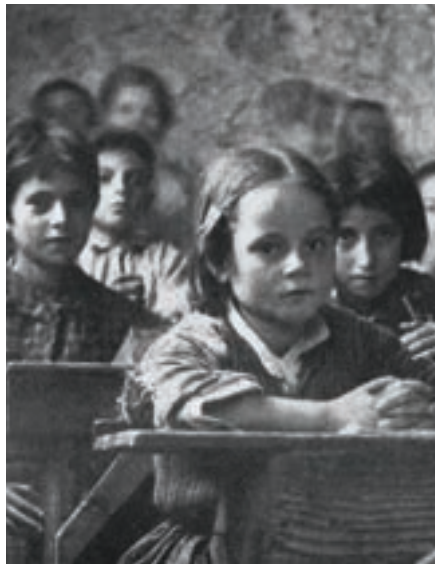
A student in the Macedonia Project's public health program, c. 1939. NEF established its first Home Welfare Center in Makriyalos, Greece. The center worked to teach the community simple techniques for improving home hygiene, sanitation, and food and diet practices.