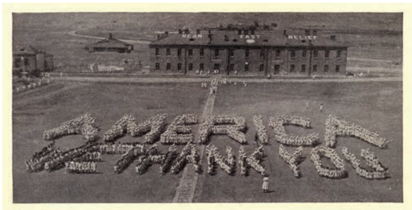
Nearly 2,500 children form a message for the American public at Seversky Post, part of the Alexandropol orphanage complex, circa 1923. This iconic image was used in brochures and thank-you letters.