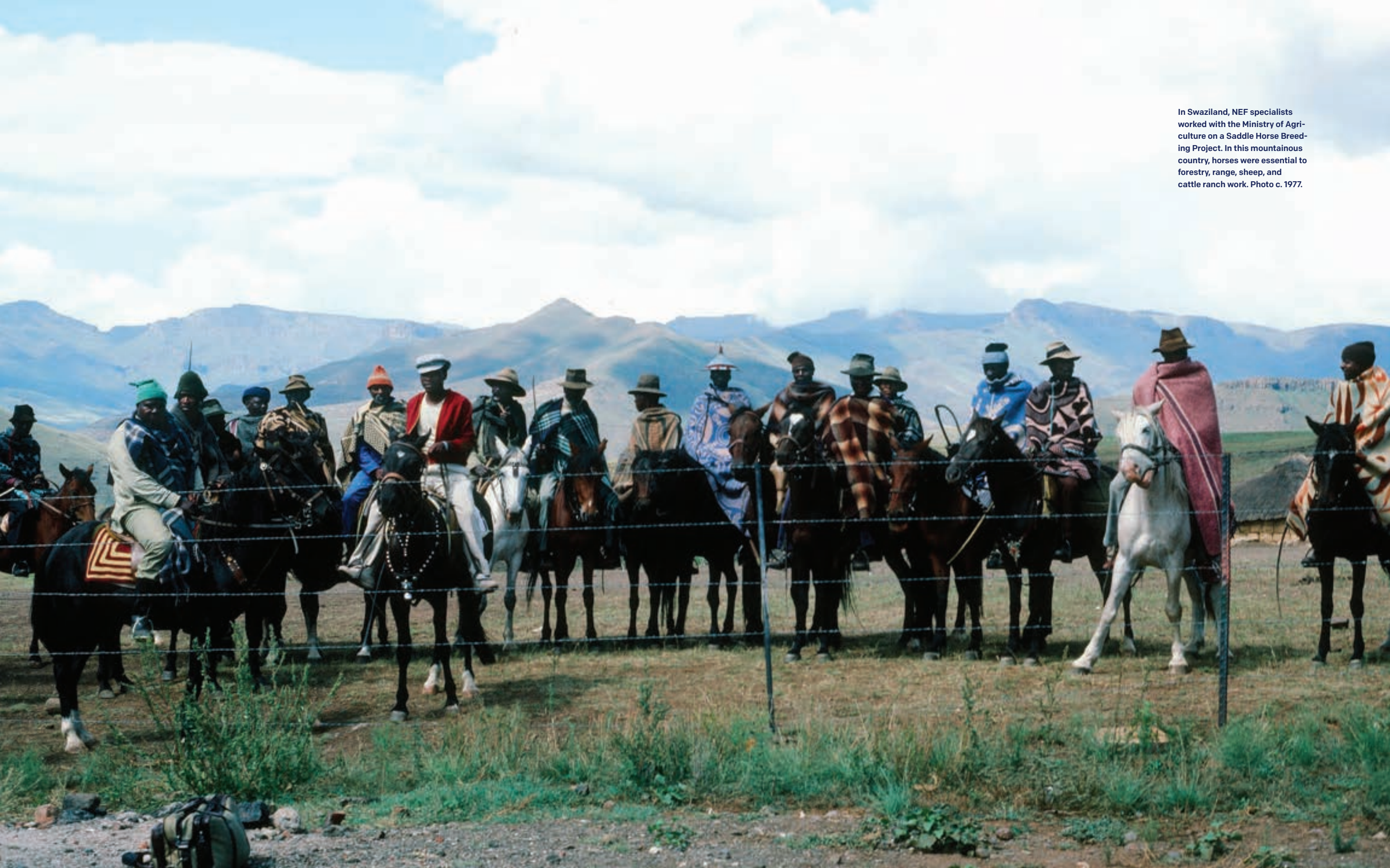
In Swaziland, NEF specialists worked with the Ministry of Agriculture on a Saddle Horse Breeding Project. In this mountainous country, horses were essential to forestry, range, sheep, and cattle ranch work. Photo c. 1977.