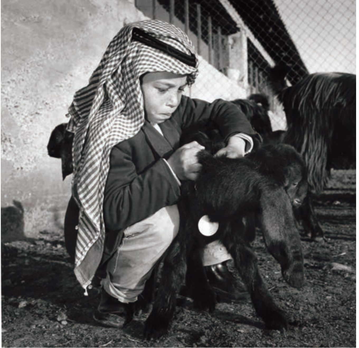
A boy with a Shami goat, Jordan, 1964. NEF's goat improvement program crossed local breeds goats with a breed that supplies more milk, meat, and hair per animal – allowing farmers to maintain the supply of these commodities while reducing the number of goats—animals that are notoriously destructive.

ganization. It conducted literacy classes, built playgrounds and enlarged schools, established clinics and child care centers, and developed water infrastructure. NEF operated demonstration programs in Amman and Ramallah; in 1958 a third center was opened in Beitt Hanina.