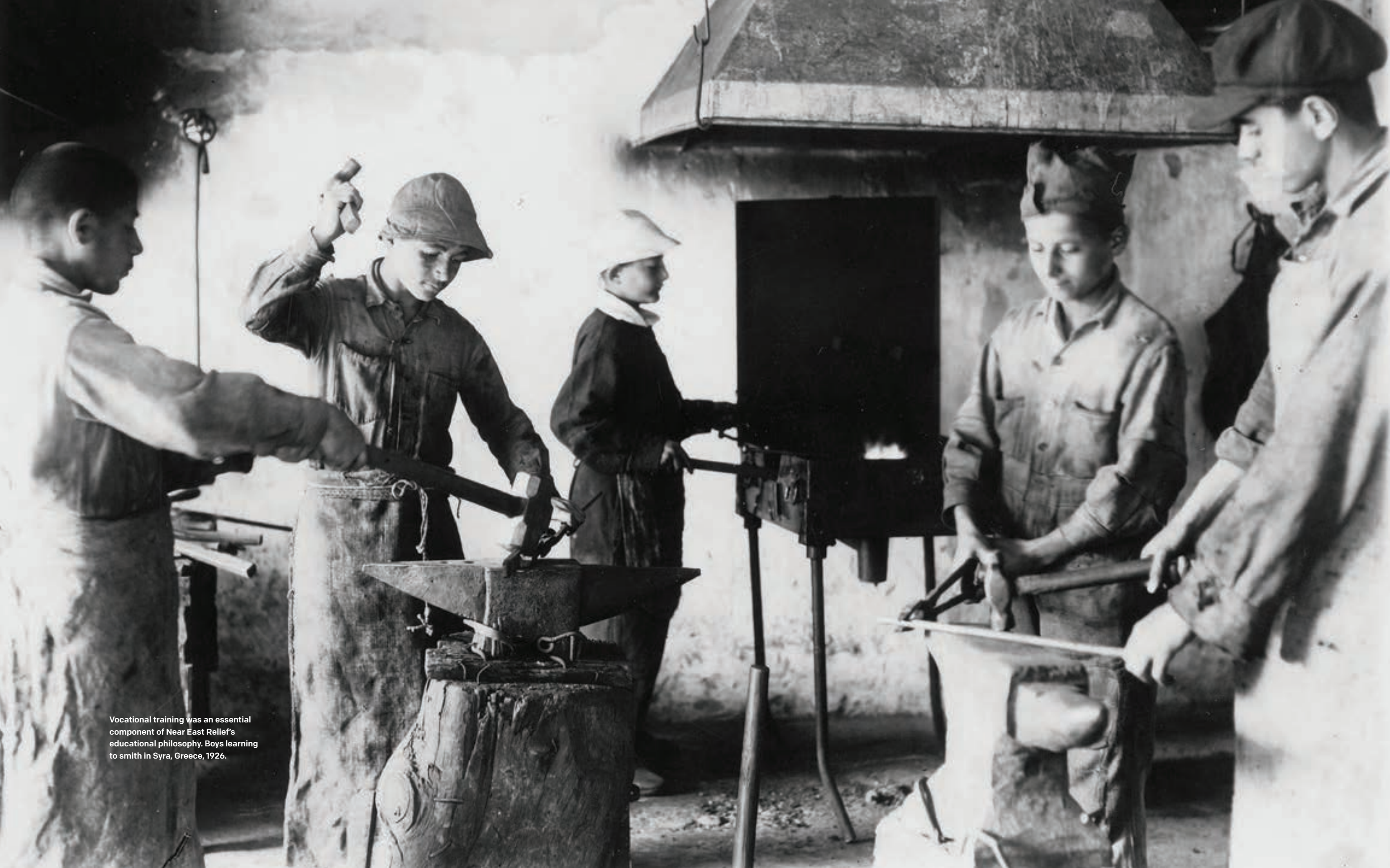
Vocational training was an essential component of Near East Relief's educational philosophy. Boys learning to smith in Syra, Greece, 1926.