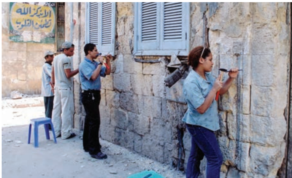
Youth learn techniques for renovating deteriorating housing in Cairo's ancient Al-Darb Al-Ahmar neighborhood, c. 2002. Opposite: NEF introduced fish farming practices to Jordan beginning in the 1980s. The industry provided a source of economic opportunity and met growing local demand for fish, c. 1988.

ship with and adopted by local communities. Initially, that largely meant government partners. With the emergence of civil society, NEF became equally committed to partnerships with civil organizations as a vehicle for local integration and long-term sustainability. In many NEF programs, strengthening these nascent groups has become a central aim.