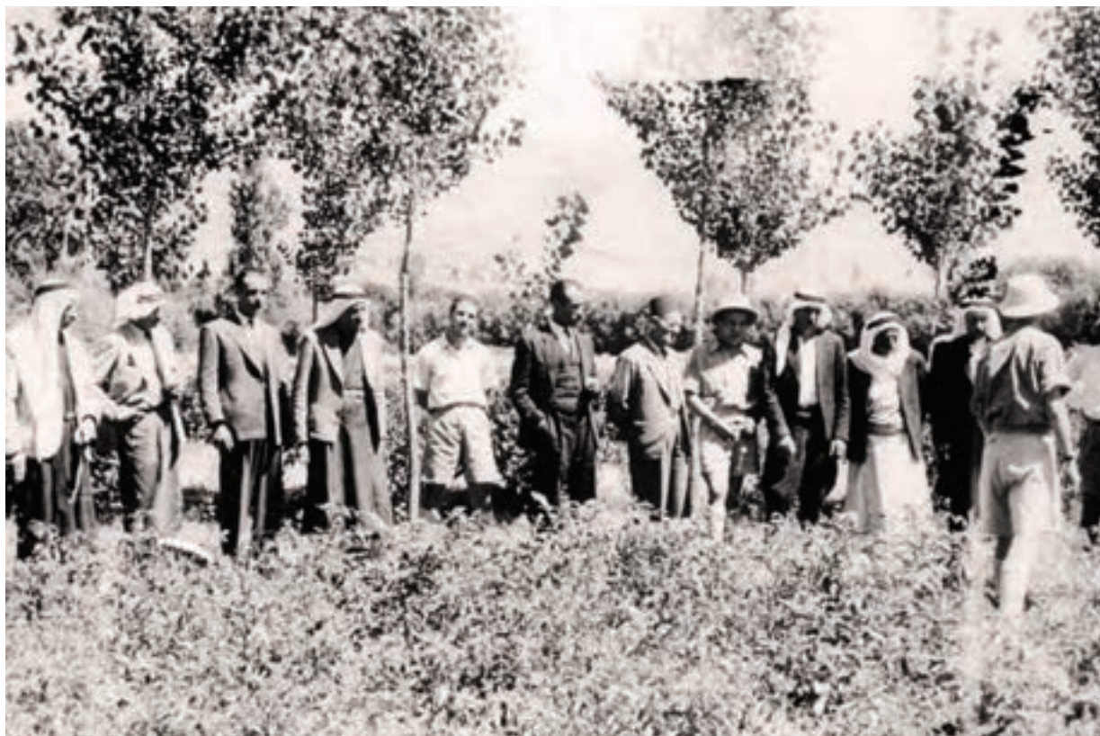
Above: Farmers from Chtaura and Bar Elias gather for a training. Bekaa Valley, Lebanon, c. 1945.