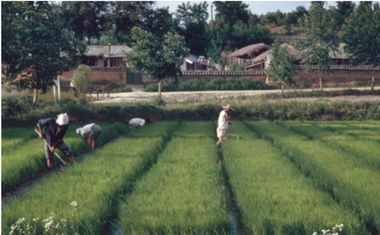
Rice farmers in Korea, 1962. NEF worked with the Korean government on community development programs from 1958-1963.

Eastern countries where NEF had previously worked. The program concluded in 1963, and NEF did not seek to expand its work in the country. In part, this decision reflected the significant presence of other development organizations and the sense among NEF's leadership that other areas with more pressing needs could be better served by the organization.