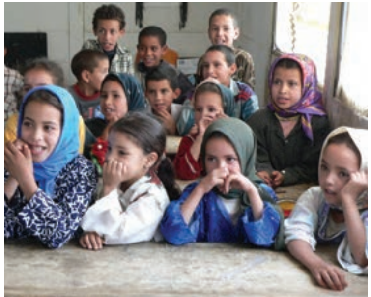
Schoolchildren in Morocco's High Atlas Mountains, c. 2005.

Soon, NEF expanded beyond the High Atlas Mountains and across southern and central Morocco. Working closely with the Ministry of Education, NEF utilized its model for strengthening PTA engagement to improve rural education. It