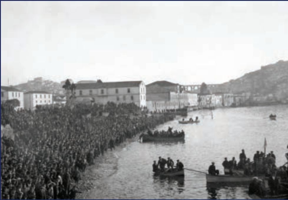
The quay at Smyrna, c. 1922. Near East Relief assisted hundreds of thousands of refugees awaiting evacuation from Turkey to Greece in the wake of the Smyrna disaster.