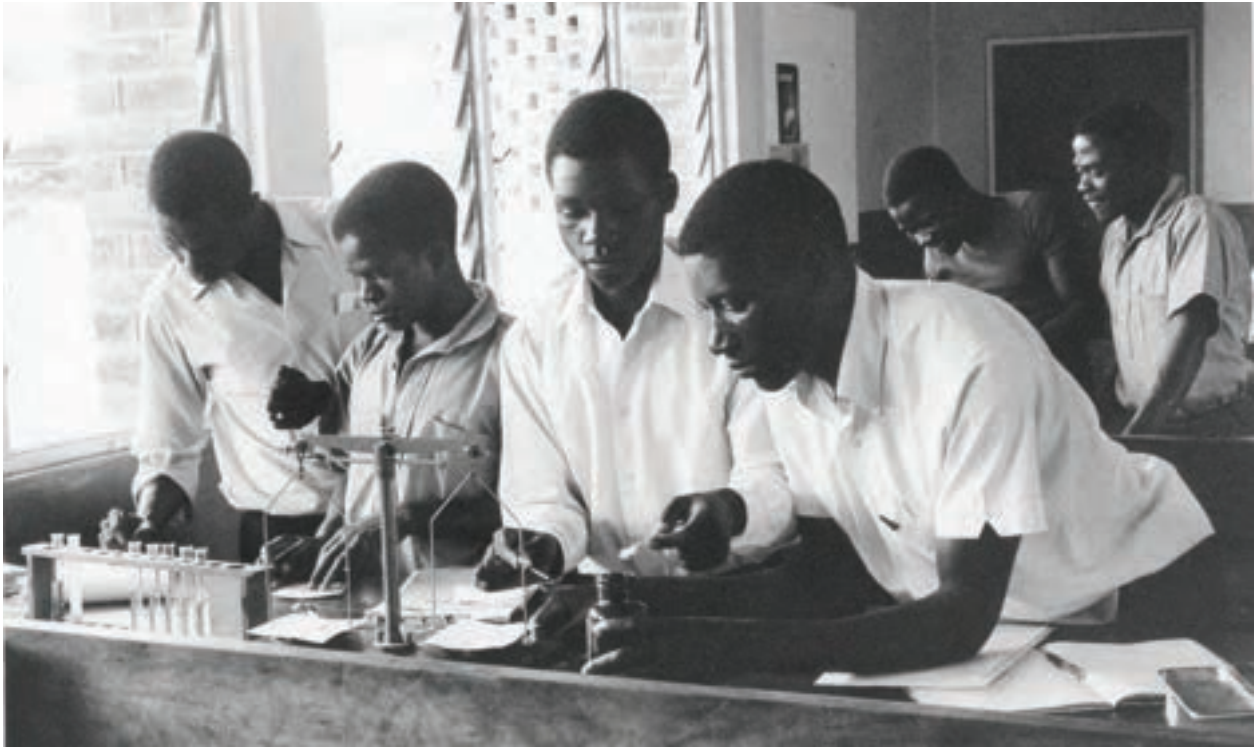
Above: At Colby College in Malawi, NEF trained instructors and staff in agricultural topics and teaching strategies. At the end of the 6-year project, the Malawi faculty and staff adopted responsibility for operating the college. In this photo, young men weigh seeds as part of their coursework, 1969. Below: Women listen as an extension agent discusses Sorghum, Botswana c. 1975.