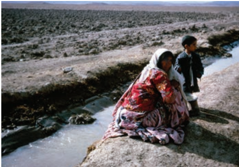
When NEF began working in Iran, clean water was scarce and preventable diseases were widespread. NEF helped improve access to clean water by digging wells, capping springs, and installing infrastructure. These improvements both protected against waterborne disease and reduced the risk of malaria by eliminating standing water around uncapped springs. Bottom: A woman gathers water from an irrigation channel. Top: A woman draws water from a capped spring.