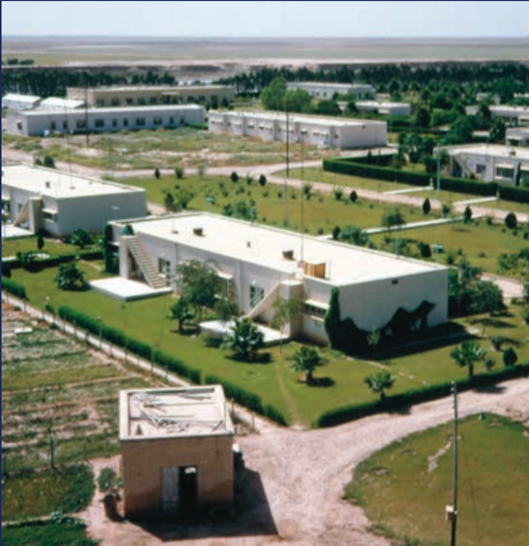
Ahwaz Agricultural College in Iran's Khuzestan Province, 1964. The college included a working farm and orchard. Beginning in 1958, NEF helped to develop the College and continued to provide technical assistance and guidance for a decade. NEF helped the college to evolve into a four-year university.