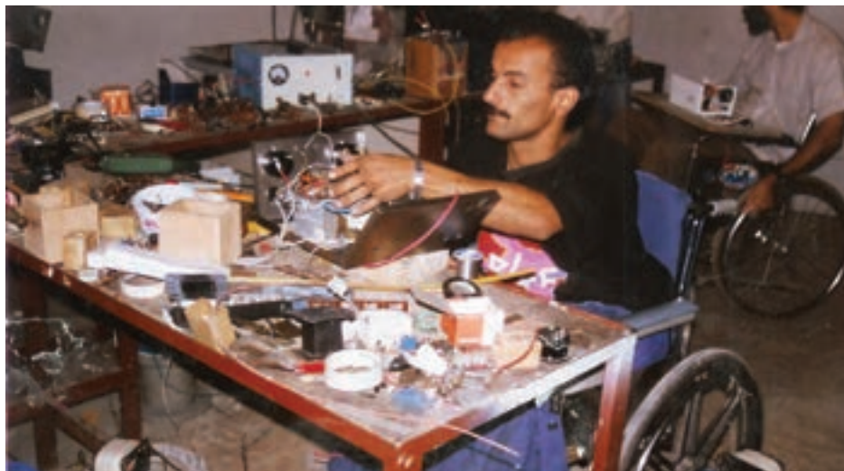
NEF provided vocational training and other support to help people with disabilities, such as these electricians, and many others start small businesses in Lebanon, c. 1990s.

In 1998, NEF launched an initiative to establish micro-credit facilities that provided financial services to low-income families historically excluded from access to credit. The program operated in four rural and peri-urban communities, Zahle, Tripoli, Sidon and Nabatiyeh, representing a religious and geographic cross-section of Lebanese society. Starting with less than $80,000 in seed money, the initiative eventually made loans exceeding $750,000, with an overall repayment rate of 92 percent (100 percent from women borrowers). Funds varied from traditional banking to Islamic lending, depending on community preferences. Lending favored widows, refugees, and persons with disabilities. Loans supported a variety of income-generating and small business activities including the establishment of home-based projects, the expansion of small retail shops, street vending, cleaning businesses, and transportation services. Programs were designed not only to increase economic opportunities for participants, but also to strengthen relationships between local civil society organizations and community residents.