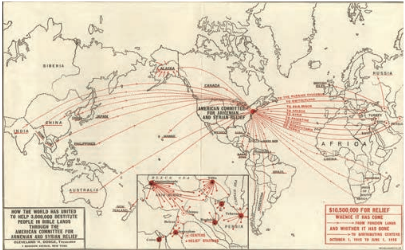
Child Actor Jackie Coogan and the boy scouts cooperated to fill a NER Milk Ship. Admission to Jackie Coogan movies was a can of milk, 1924. Top Right: Farmers in the American Midwest and Canada donated grain through the popular "Say it with Flour" campaign, 1921. Bottom: People around the world sent donations and, by 1918, the Committee had raised $10,500,000 for relief.