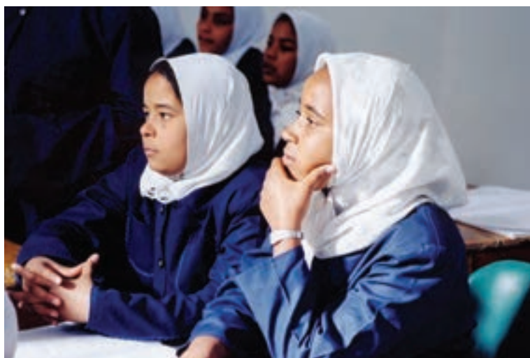
Top: A fish seller in Konna, Mali, was able to start and expand her business with micro-credit from NEF's Nayral microfinance institution, 2013; Bottom: Young Egyptian women study to become nurses in NEF's award-winning nursing education program, 2004.