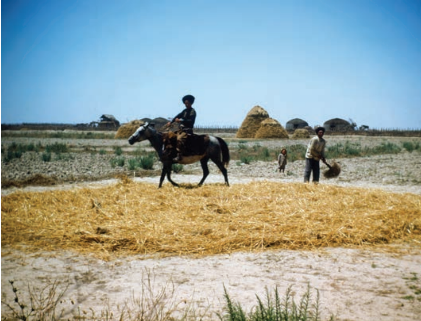
Threshing wheat in Turkey, c. 1934. NEF partnered with the International College in Izmir to develop a Rural Life Institute in Turkey. The effort had some successes in training local sanitation workers, but was short-lived.