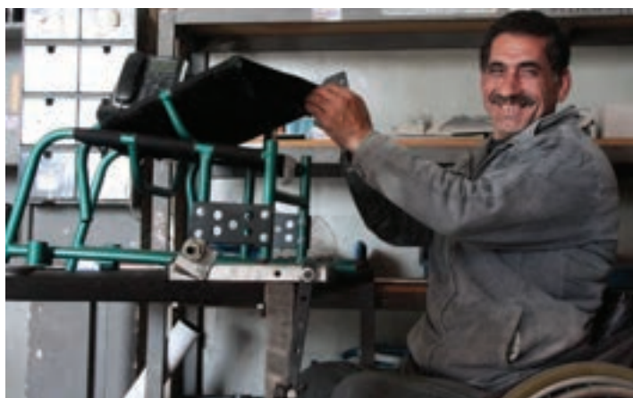
NEF works to promote economic inclusion in communities throughout the region. With NEF training and support, this Nablus wheelchair manufacturing and repair facility became self-sustaining. It is managed by the people with disabilities who work there, and it continues to operate independently today. Photo c. 2008.

and peacebuilding through economic cooperation. Building upon its long history and extensive network in the region, NEF remains faithful to its original model for development: cooperation with local partners and technical innovation adapted to local context to help people build more sustainable and prosperous communities. While NEF no longer frames its work in terms of the “four essentials of civilization,” it remains committed to holistic ap-