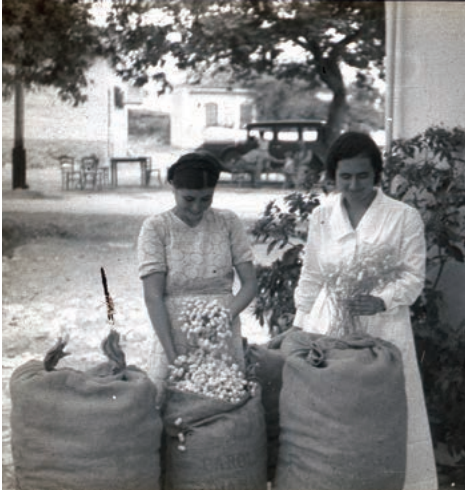
Women in a Macedonian village inspect silk cocoons. The Macedonia Project worked with villagers to promote sericulture, particularly among women, by planting mulberry trees and building silkworm nurseries. Greece, c. 1930s.

Project staff were found among recruits from primary and secondary agricultural schools. Over time and with intensive on-the-job training, a corps of talented agricultural field workers developed. Each field worker was assigned to a cluster of villages. He traveled from village to village, advising farmers on tree and vineyard production, raising tobacco, cotton, corn, potatoes, legumes, and other vegetables, silk production, animal husbandry, beekeeping, and control of pests and diseases. Local committees of farmers were organized to inform planning and implementation.