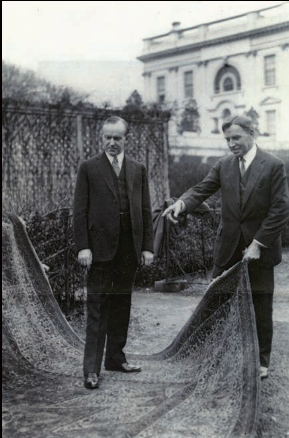
The girls from Ghazir Orphanage earned a reputation as skilled weavers when they created an elaborate rug for President Calvin Coolidge. Coolidge and Near East Relief board member John H. Finley at the White House, December 1925.