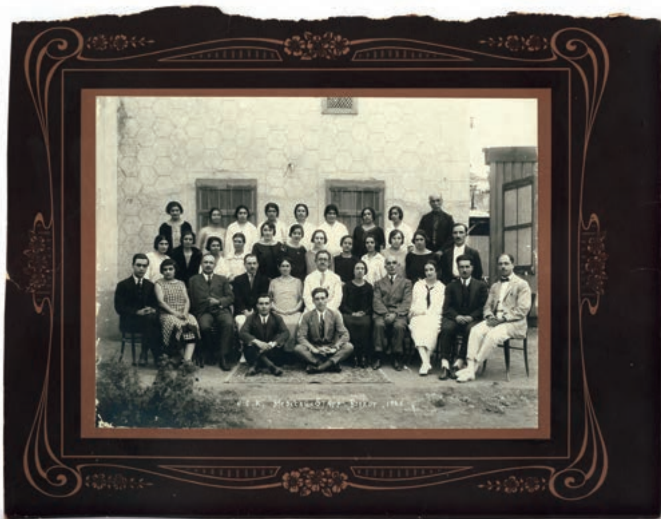
Near East Relief's Beirut medical team, 1925. NEF built upon NER's experience to expand access to medical care and improve public health for refugee and local communities alike.

various farming practices and sanitation.