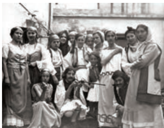
A group of girls at the Youth Welfare Center in Athens. The girls had performed in a play and a dance to celebrate Greek Independence. Athens, Greece, c. 1930s.

During World War II, NEF operated a child feeding station inside the community building, while the Axis forces commandeered playground for drilling exercises. Tragically, the Nazis used the field to carry out mass executions. After Occupation, it became a British detention camp for wayward British troops. 16