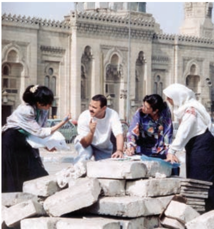
Staff of NEF's Center for Development Services use participatory techniques to involve residents in planning improvements for Cairo's Tablita Market, c. 1990s.

Jordan: Fish Farming. In 1985, NEF worked with aquaculture specialists from Auburn University and the Tennessee Valley Authority to develop a model freshwater fish farm in Jordan's Azraq Oasis. The model would help meet growing local demand for fish in water scarce areas. Over the following two decades, NEF adapted this model for a broader range of local conditions, including in Lebanon and Egypt, and lead the expansion of commercial fish farming into the Jordan Valley and Gaza.