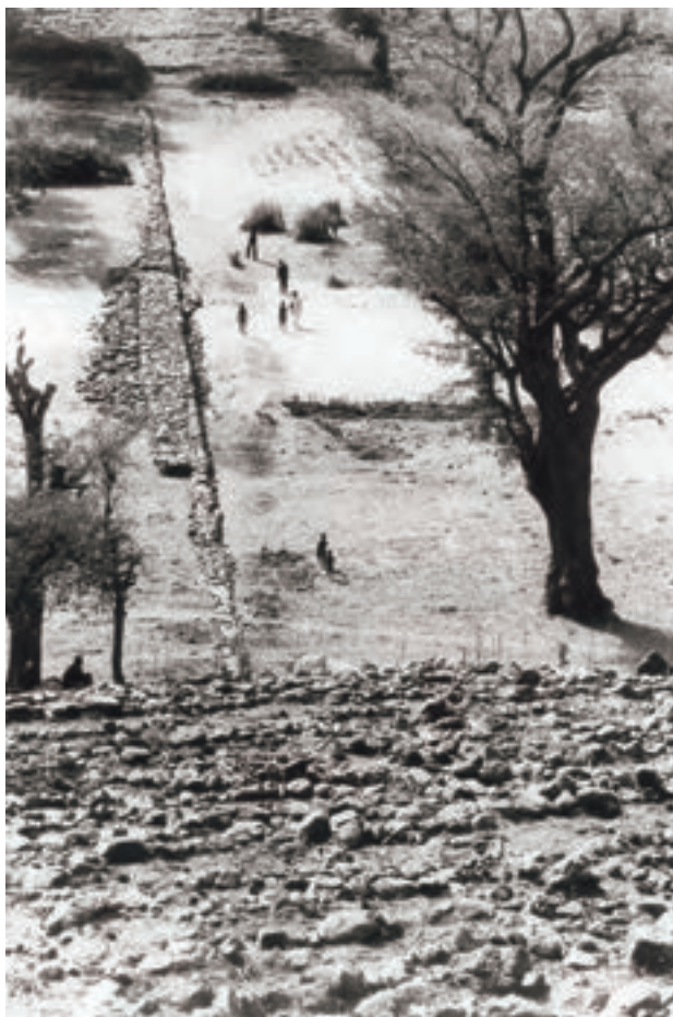
NEF helped communities in Mali's Mopti region build simple stone dams to slow rainwater runoff and improve groundwater recharge, 1988.