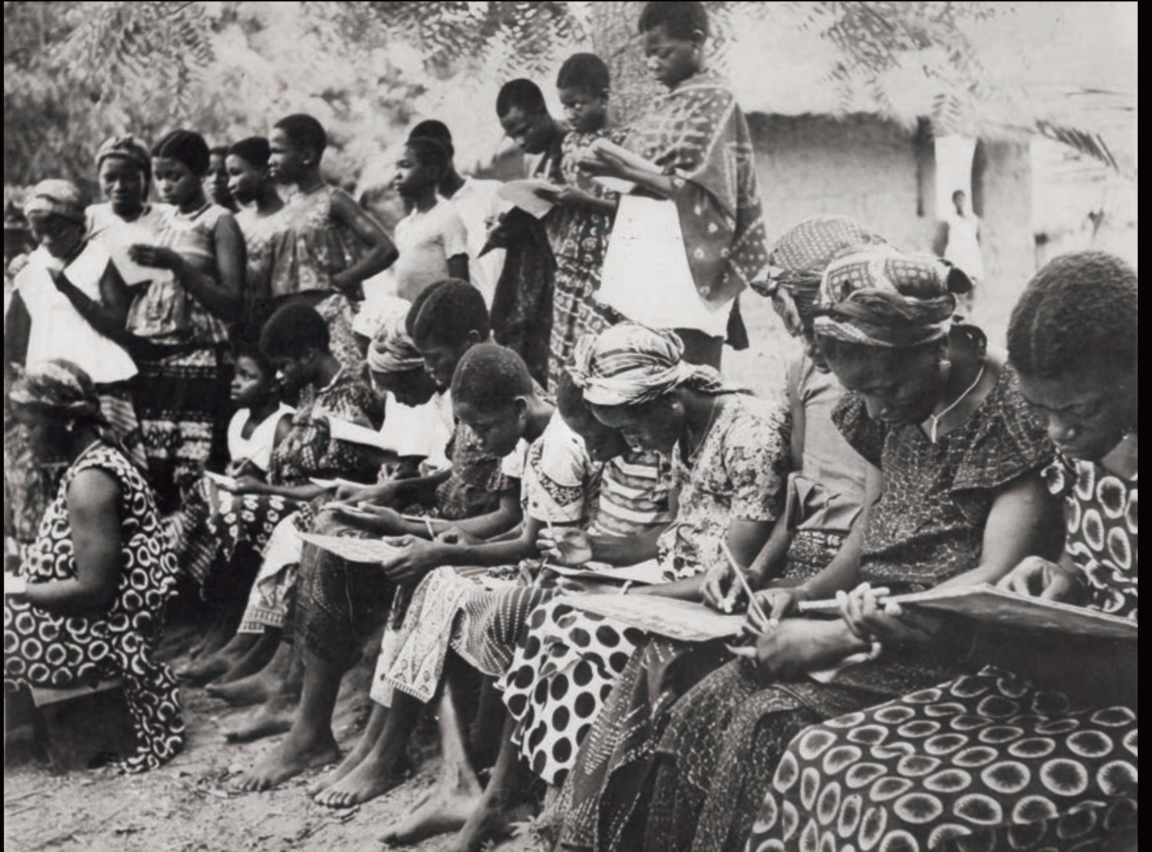
A women's literacy class. Togo, 1966.