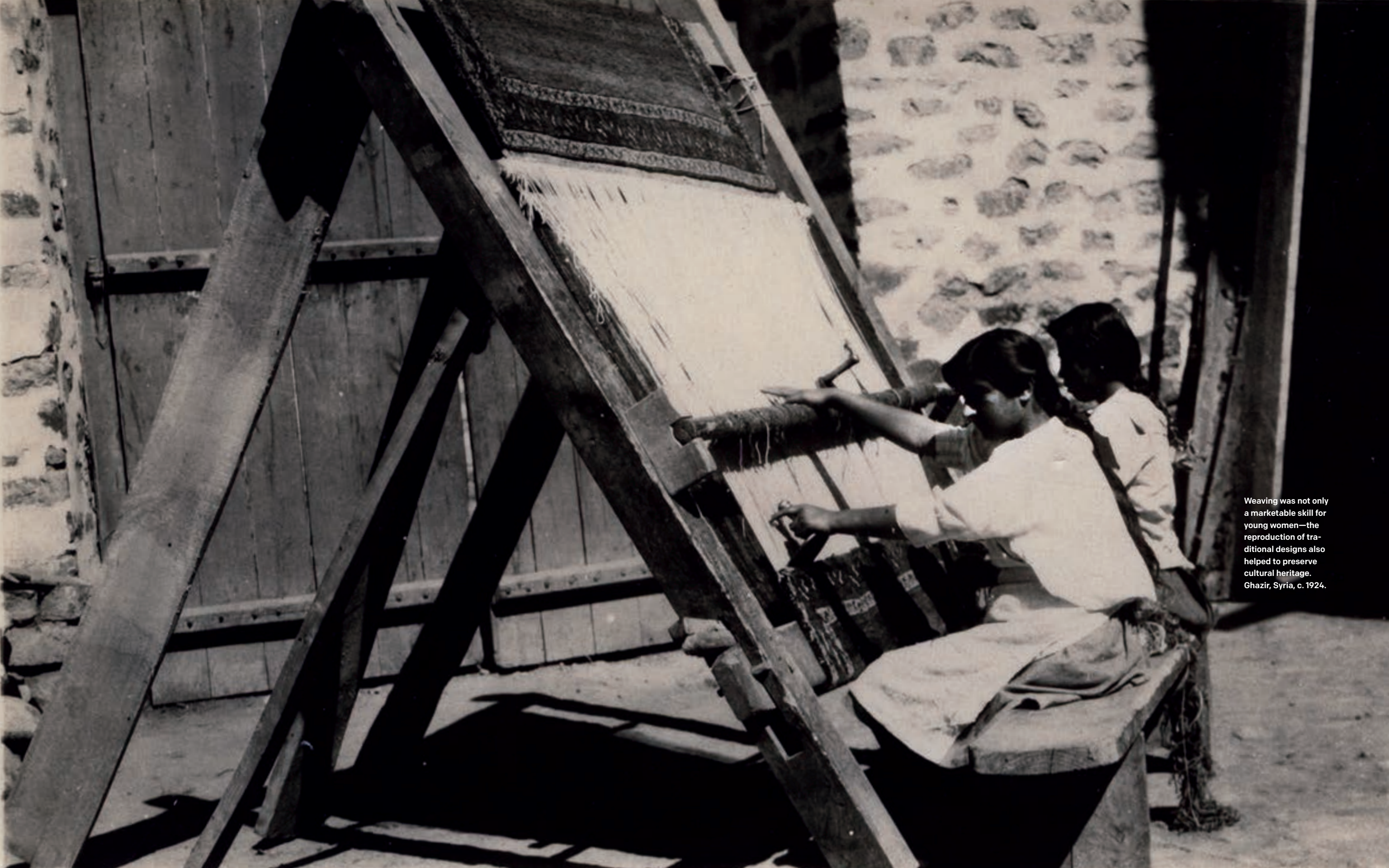
Weaving was not only a marketable skill for young women—the reproduction of traditional designs also helped to preserve cultural heritage. Ghazir, Syria, c. 1924.